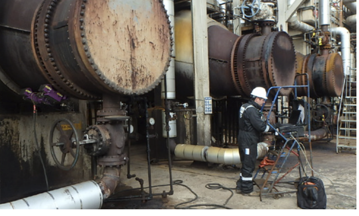
Heat exchanger, in-service corrosion mapping

SILVERWING RMS2 High temperature, up to 200 °C Remote access for increased safety Repeatable, reliable & recordable results