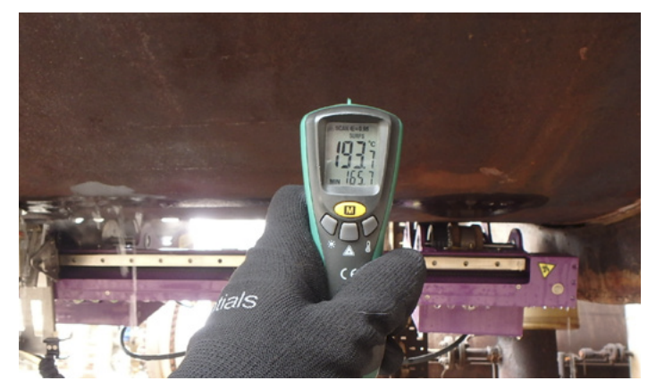
Elevated surface temperature